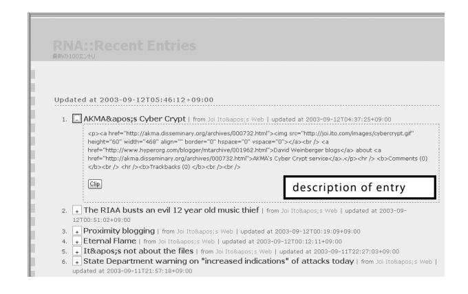
Fig. 1. Snapshot of our system

When the user finds favorite contents, he/she registers it as a bookmark by calling up bookmarklet, which is a tiny application described by JavaScript. The user can add a comment and tags in the register interface.